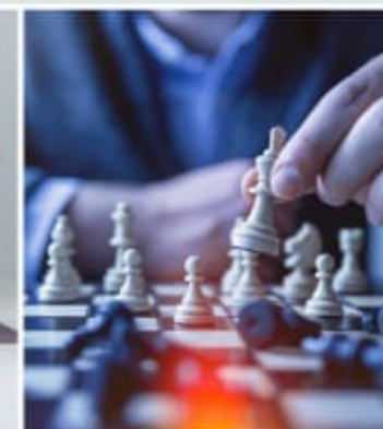
Indoor Games Area