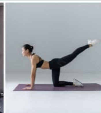
Yoga & Meditation Room